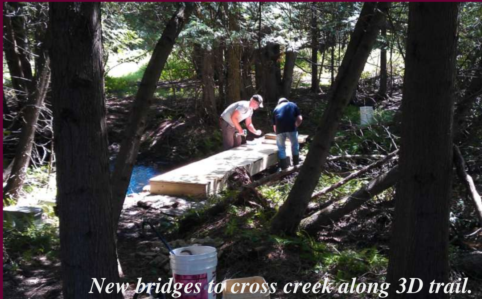
New bridges to cross creek along 3D trail.