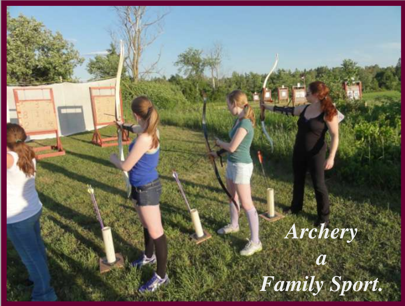
Archery a Family Sport.