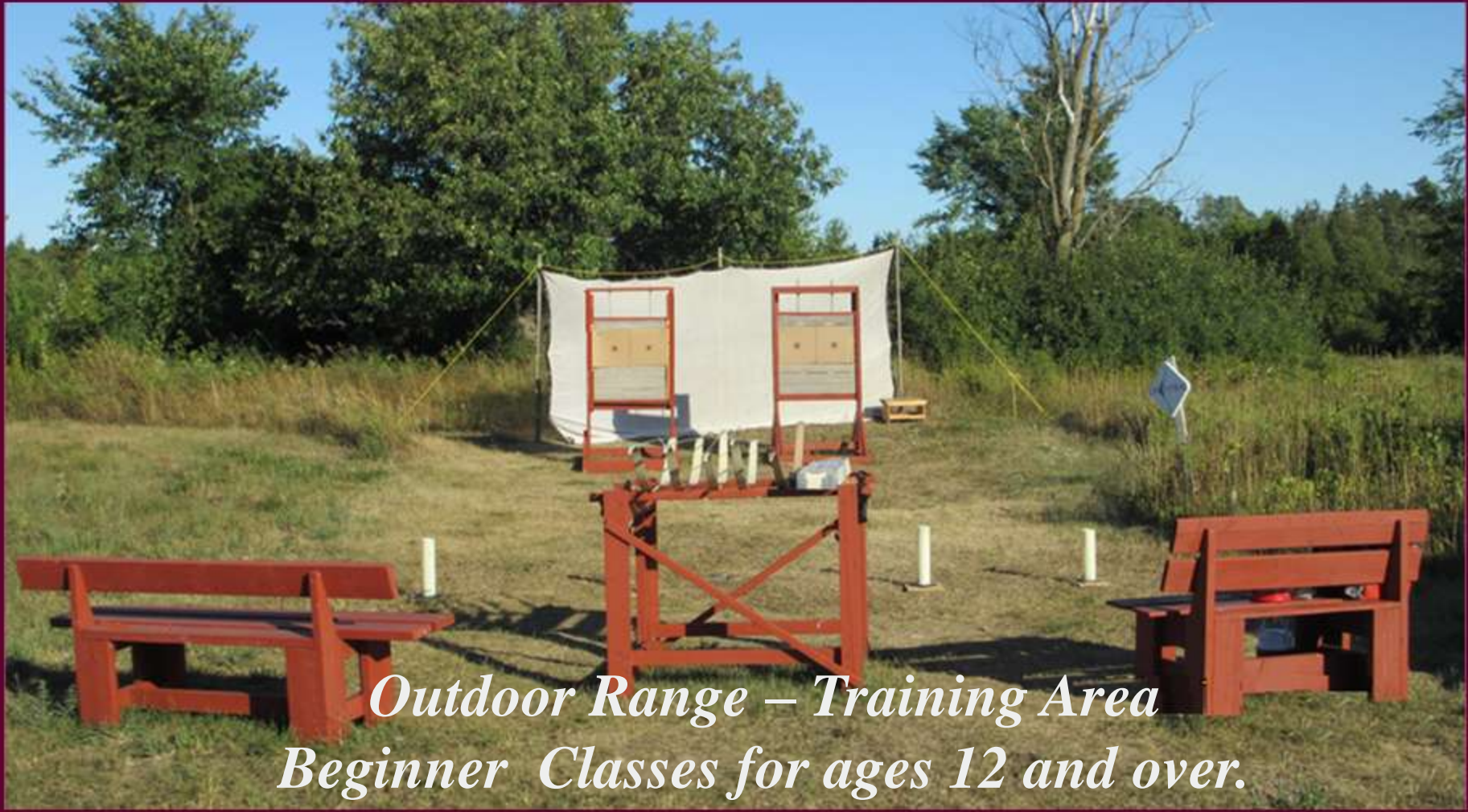
Outdoor Range – Training Area Beginner Classes for ages 12 and over.